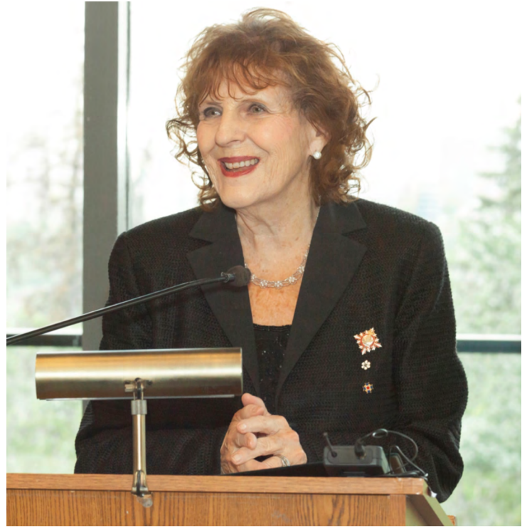
Her Honour, the Honourable Lois Mitchell speaks to our Memorial Banquet.

formal military mess dinners, with the support and participation of local regular forces units. Formal evening gowns and long white gloves were typically worn by the ladies. The gentlemen attended in black tie or mess kit as most do now, but some were also in tails.