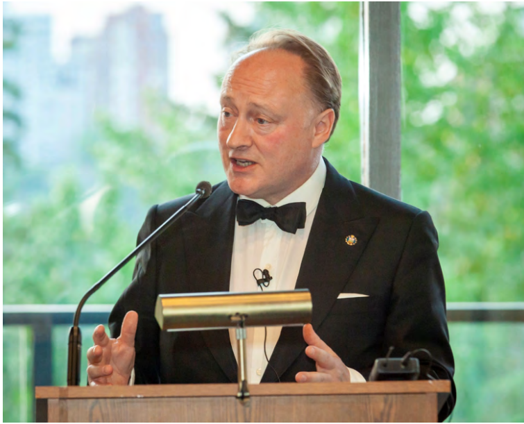
Historian Andrew Roberts speaks of Winston Churchill; the real person.

banquets by dining in a separate room and listening to the proceedings by remote audio. This changed in the mid-1980s when membership in the society with its associated privileges was opened to women. The segregation of the ladies at the banquet was ended. They could enjoy the event first-hand, including the after-dinner cigar smoke (some things changed more slowly). Since then, several women have served on the board of directors and as officers. We now have our first female president, and three other women serve as directors or officers.